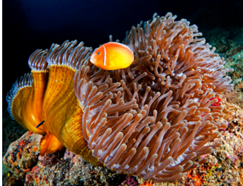
Sea anemone and clownfish taking care of each other.

the privilege of being there made our comfort pale in comparison to their hard work