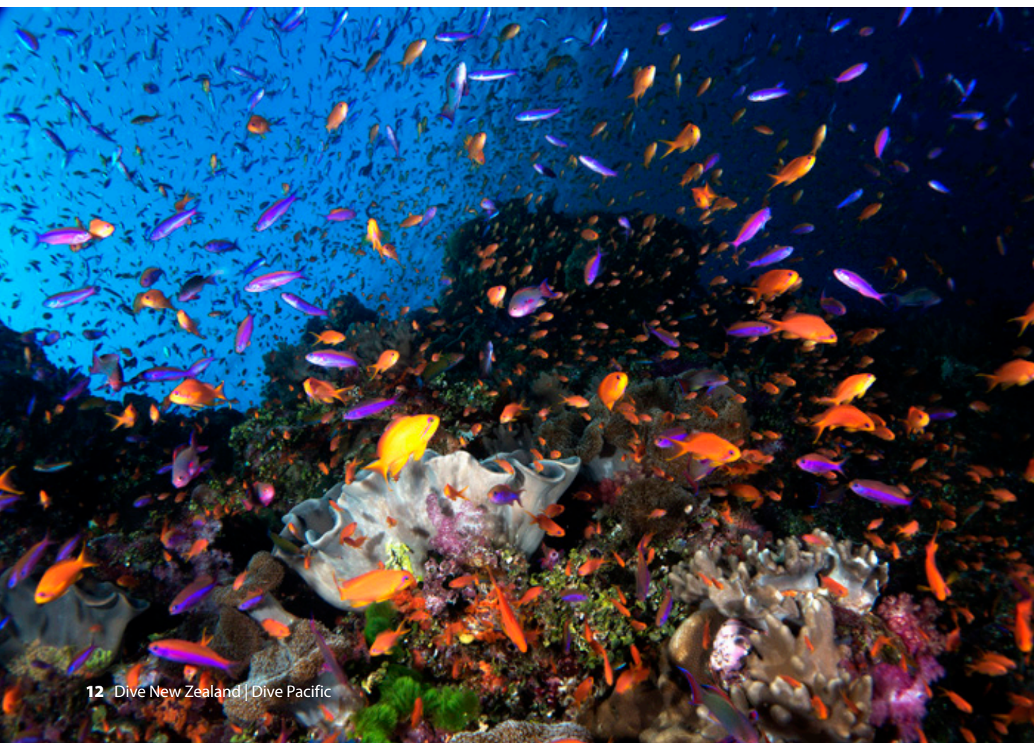
The walls are teeming with life.

We dived sites such as 'Instant Replay' – an aptly named drift dive which was over before it began! 'Purple Haze' – walls of black coral and gorgonian fans, 'Heartbreak Ridge' with its amazing swim-throughs and massive gorgonian fans, and my favourite, 'Mellow Yellow' – a coral stack 30m in diameter, walls down to 60m covered in every kind of soft coral and colour you can imagine. A photographer's dream both wide-angle and macro – just amazing.